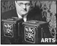
Rescuing the Met's Archives