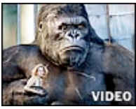
Movie Minutes: 'King Kong'