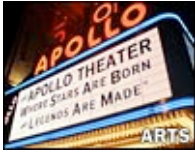
The Apollo's New Look