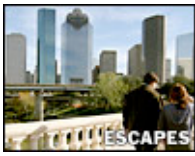
36 Hours in Houston