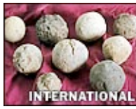
Ancient Battlefield Discovered